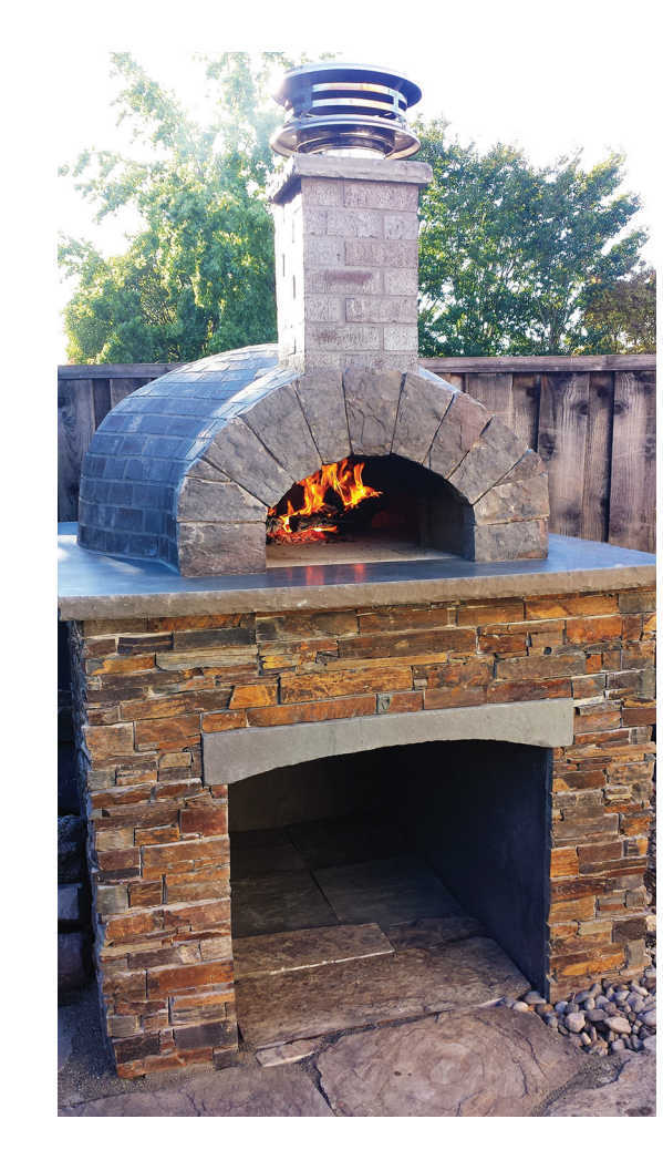
THE DIFFERENCE IS FORNO BRAVO